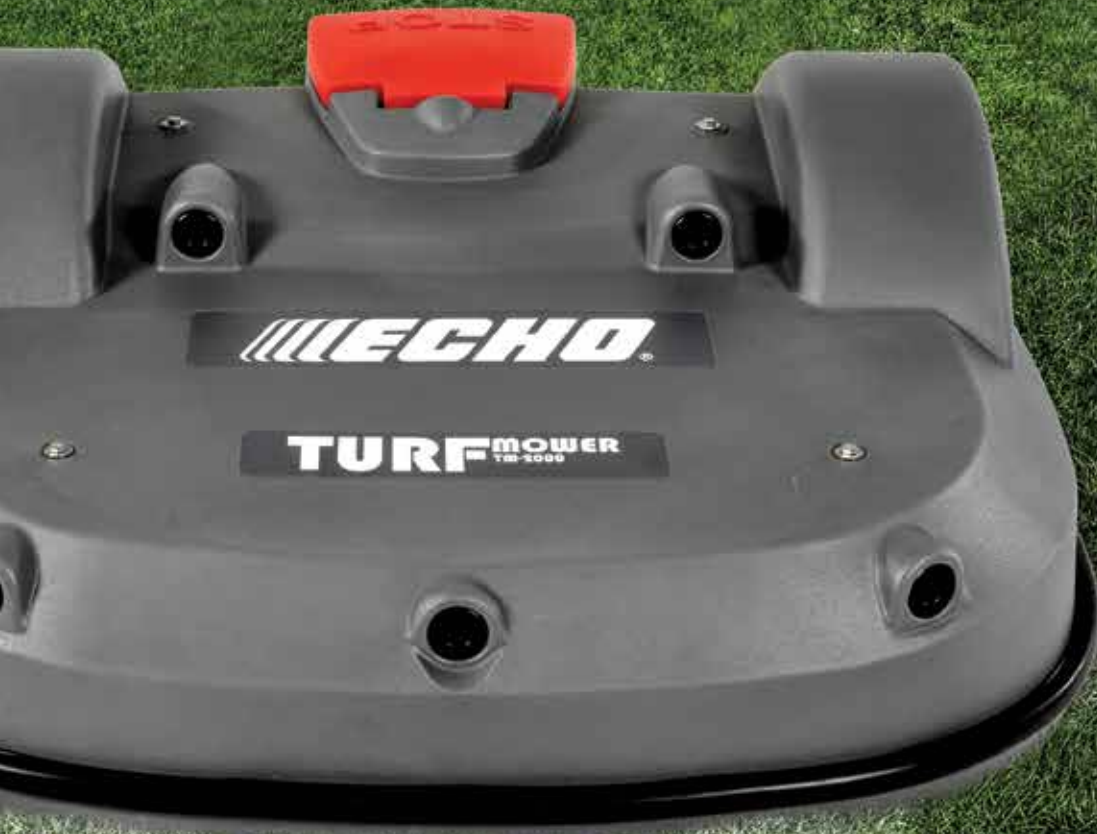
TM-2000 Turf Mower

It's a self-driving, self-charging and — best of all — self-sufficient mower that allows busy turf managers to refocus their time, budgets and resources on more important things.